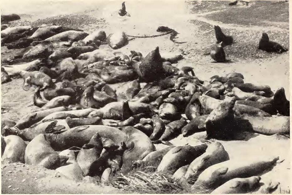
Fig. 6. Immature and subadult elephant seals (foreground) and bachelor and bull Steller sea lions (the large individuals in the middle and upper part of the picture) mingled with male California sea lions of varying ages (those on the edge of the water are adults). Año Nuevo Island, California, June 4, 1963